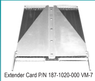
Extender Card P/N 187-1020-000 VM-7